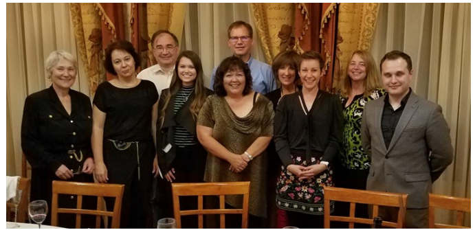
Our final farewell dinner hosted by the Oncology Dispensary